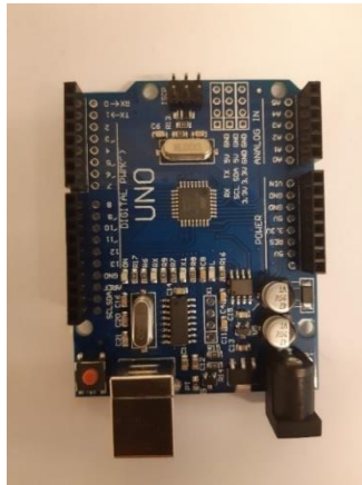
Figure 2. The Arduino Uno computer.

This exploratory study has a mixed methods case study design. Four primary school classes were observed during the robotics curriculum, and one group of high school near-peer teachers was observed simultaneously, as well as the interaction between students and the near-peer teachers. Primary school students completed a pre- and postintervention questionnaire, with respect to their STEM-attitudes. Interaction between the primary school students and near-peer teachers was recorded in the middle of the lesson project. Both the primary school students and their parents, as well as the near-peer teachers were briefed about the project before they participated, and signed informed consent forms. When the data was gathered, there was no ethical committee active. The authors declare that the principles as stated in the Helsinki Declaration are fully respected.