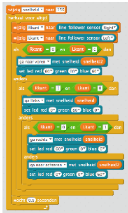
Figure 3. Example of a set of commands in Scratch.