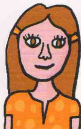
Isa nine years old